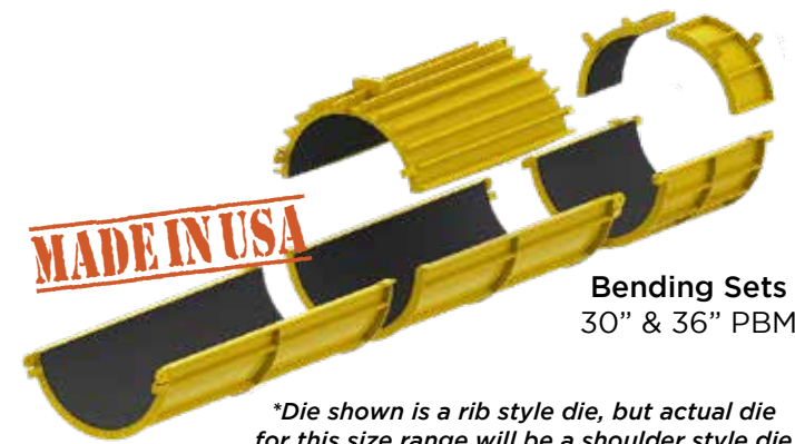
Bending Sets 30" & 36" PBM

*Die shown is a rib style die, but actual die for this size range will be a shoulder style die