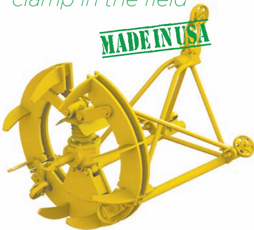
Large Manual Clamp (241)

Fastest, most reliable clamp in the field