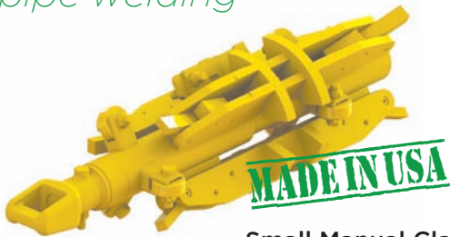
Small Manual Clamp (242W)