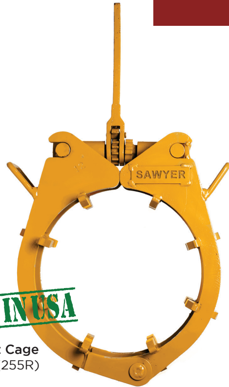
Ratchet Cage Clamp (255R)